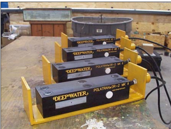
DR-2's at Deepwater Hockway's fabrication facility

The DR-2 dual reference electrode is equipped with one Ag/AgCl and one Zn reference, for unparalleled accuracy.